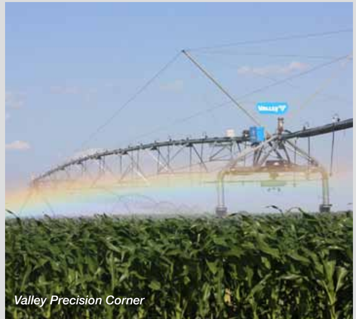
Valley Precision Corner