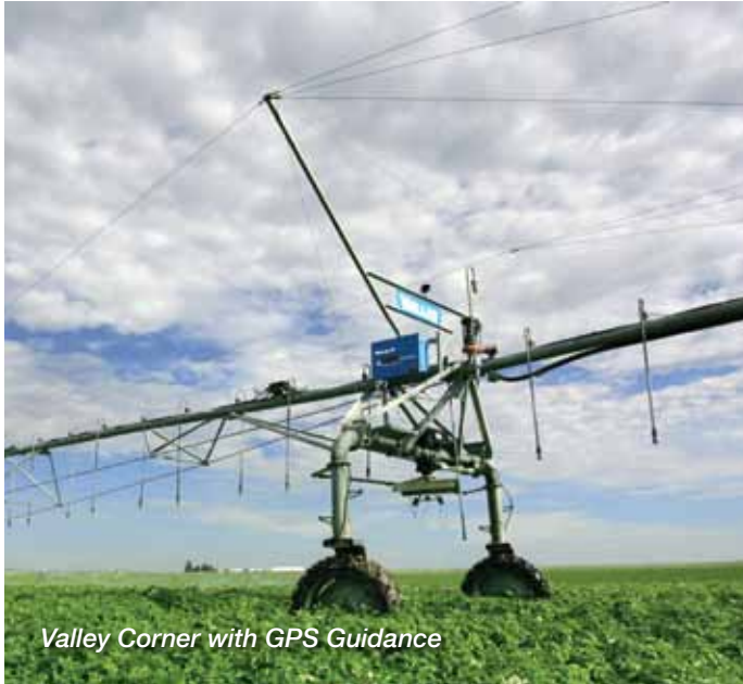
Valley Corner with GPS Guidance

For example, on a square quarter-section, a Valley Corner machine enables you to irrigate an extra 23 acres that a center pivot alone can't reach. On odd-shaped and irregular-shaped fields, you can add as many as 49 extra acres. On rectangular fields, the machine can swing out to pick up both ends, adding an extra 37 acres.