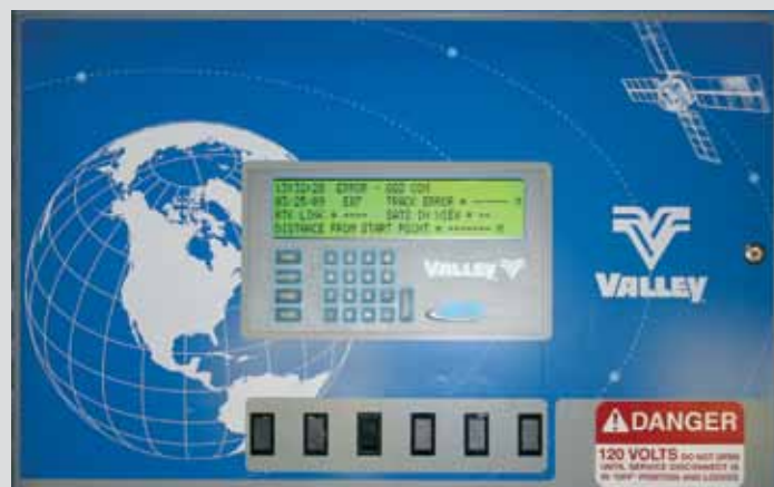
GPS Guidance panel